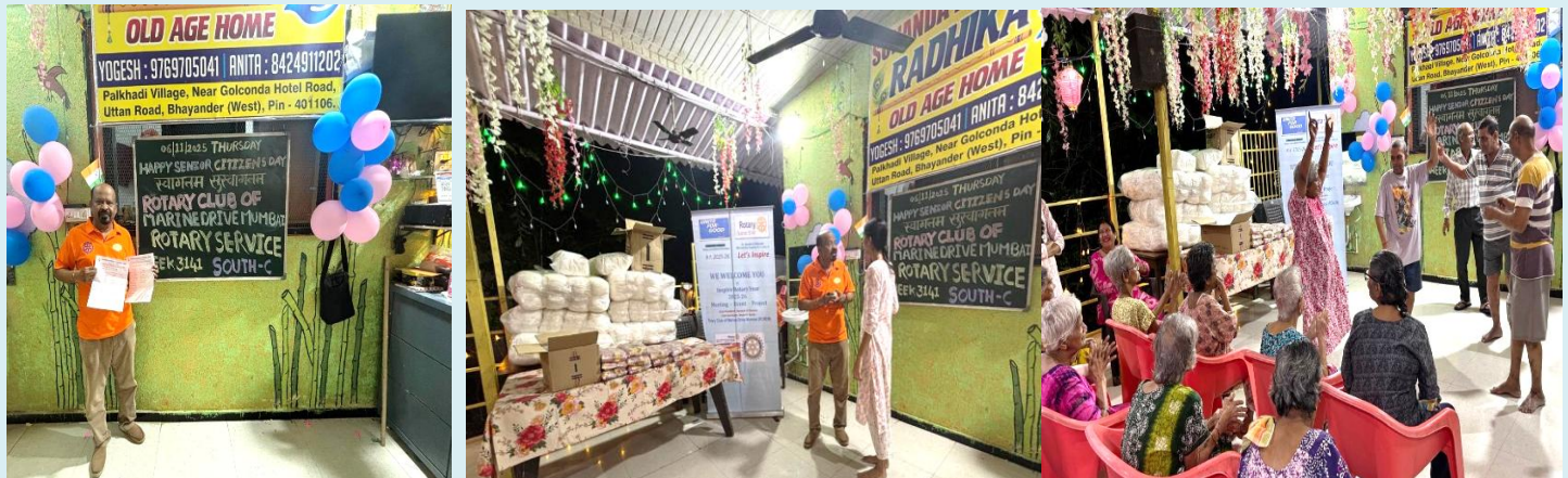
Senior citizens dancing and singing to celebrate visit by Rotarians at their old age home.