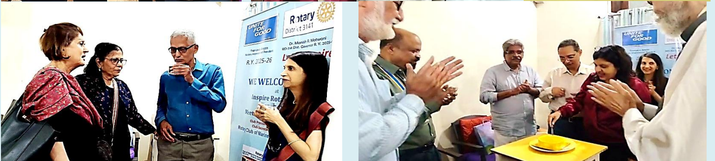
Meeting ended with spirited dinner enjoyed by all with eatables brought in by many RCMDMites. ....7.