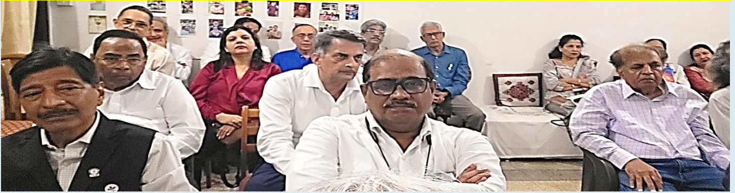
Great meeting. Great attendance. Meeting was followed by vote of thanks and then cake cutting for birthdays and anniversaries.

Cont'd: 08.11.2025: RCMDM's 5 th BOD meet cum 9 th Regular Meeting: 5pm onwards, at Soona Mahal, Marine Drive: